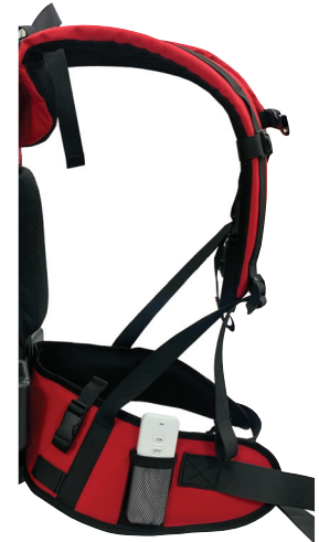
Super Comfort Harness