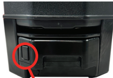
Battery Release Button